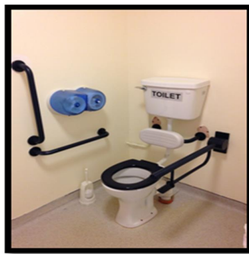
Toilets – before and after