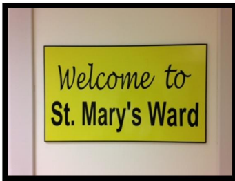
New and improved signage