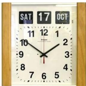
Clock/Calendars to help orientate patients