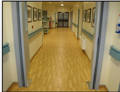
Flooring before and after