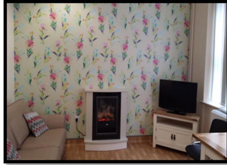
St. Mary's Dayroom before and after