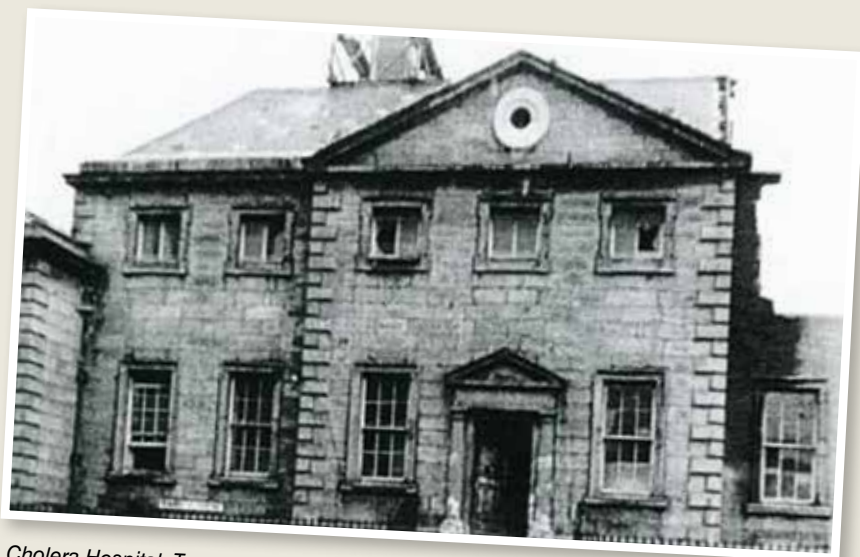
Cholera Hospital, Townsend Street