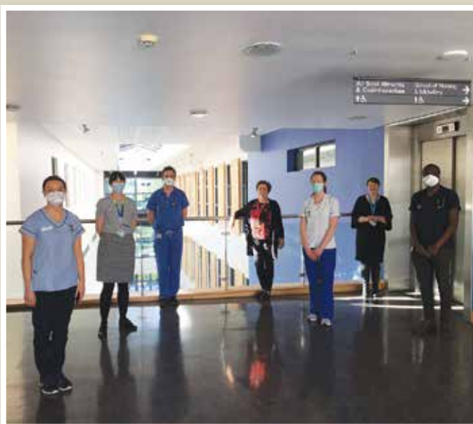
MUH and UCC staff at Brookfield